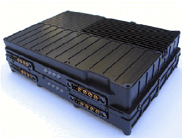
Figure 1: 250W PMU

The 250W PMU simplifies UAV power distribution by providing multiple power outputs, which are individually programmable for voltage as well as being battery-backed. Dual (redundant) battery support is also included as standard.